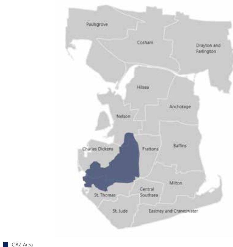
Figure 2 Boundary of proposed Clean Air Zone in Portsmouth

Portsmouth City Council has recommended to government a Class B charging CAZ to be implemented by Autumn 2021, based on evidence that all Classes B to D would likely achieve compliance in Portsmouth by 2022 and that a Class B would impact fewer vehicle categories. 15 The CAZ will cover the South West of Portsmouth where the main hotspots of air pollution can be found, an area of approximately 3km. 2