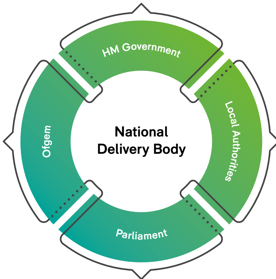
Diagram of approach: