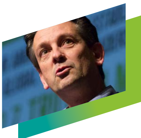
Lord Karan Bilimoria of Chelsea President, CBI