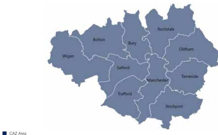
Figure 2 Greater Manchester proposed Clean Air Zone boundary

The proposed CAZ D will cover the entire administrative boundary of the region except for strategic roads and motorways such as the M602. The City Council's aim is that a coordinated approach across all ten boroughs will reduce the risk of displacement effects, where high pollution areas are simply shifted to another location, and to ensure consistent guidelines across Greater Manchester. 17